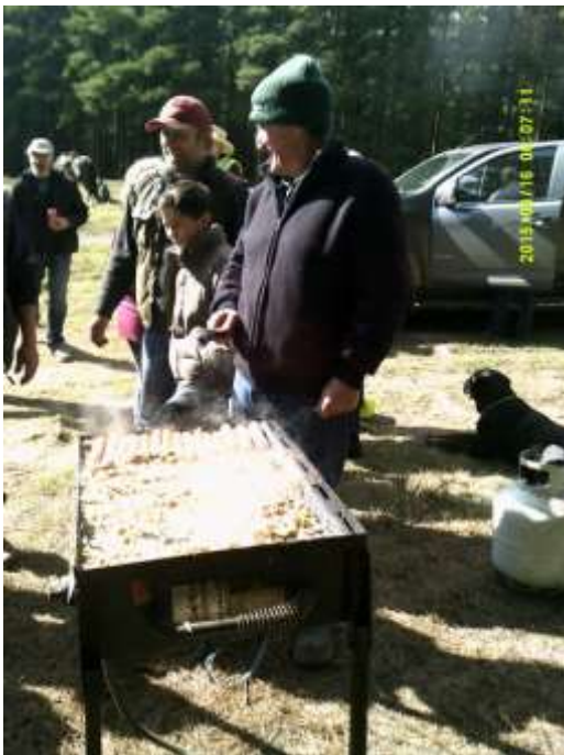
Of course they are cooked.