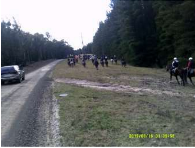
Members enjoying the ride