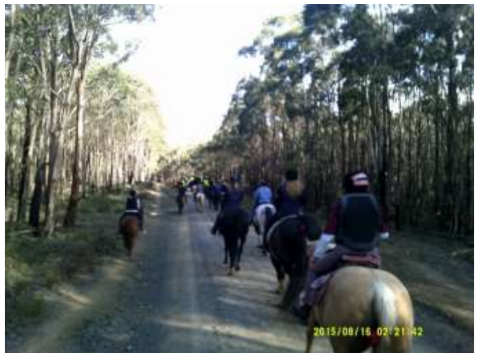
on our way home after a GR8 lunch.