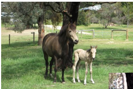
Nutmeg and her foal George