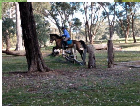
Having a jump