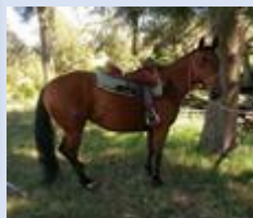
Pippa and Tinkerbell