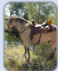
Baileys and Little Jack