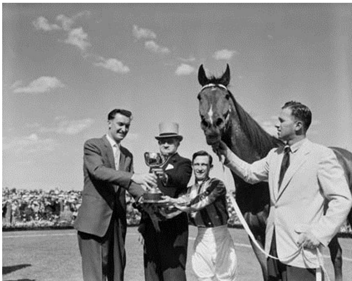
BAYSTONE AFTER WINNING THE 1958 MELBOURNE CUP