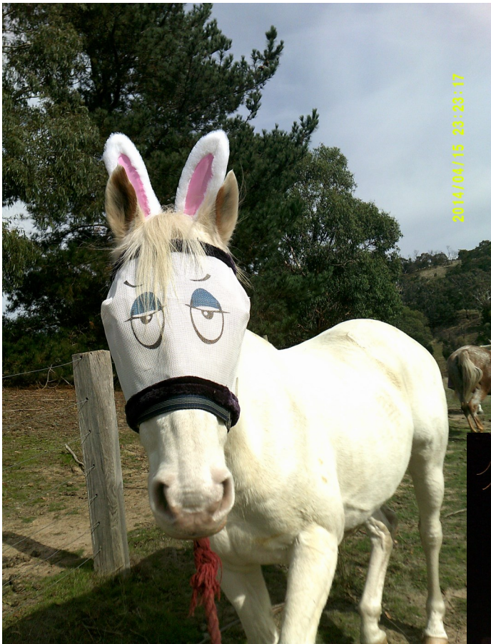
Even the horses were in the spirit