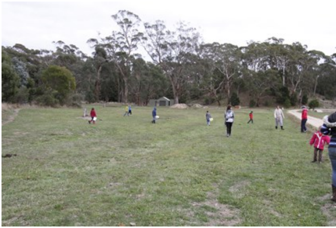
Sunday egg hunt