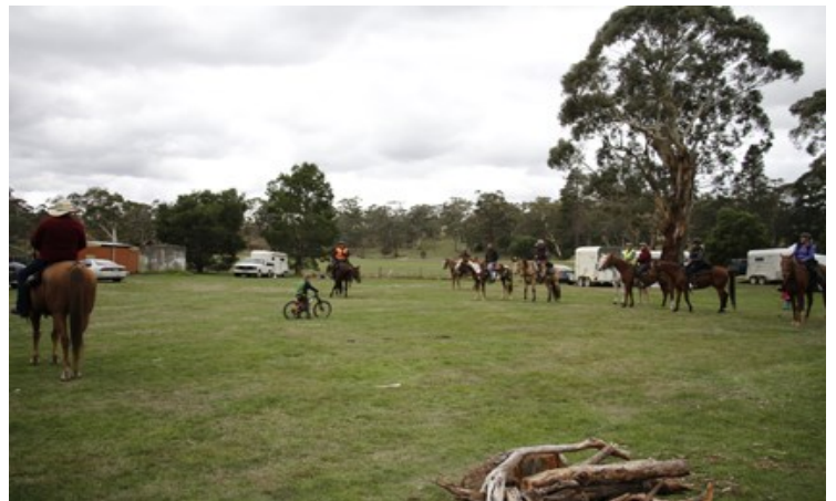
Happy Birthday to Tom